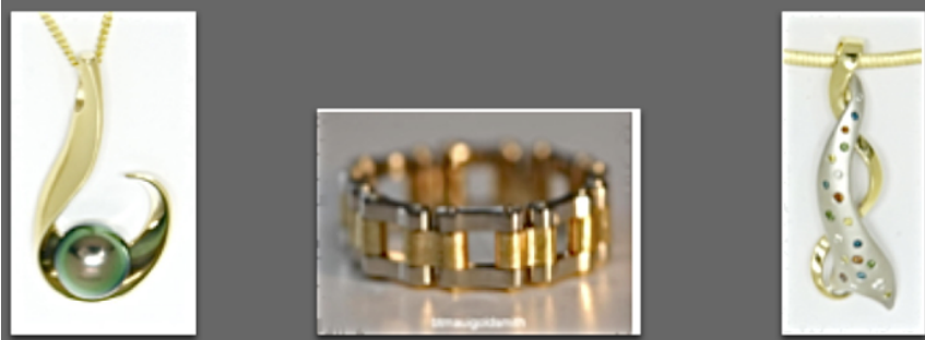
Second, third and people's and public choice winners.