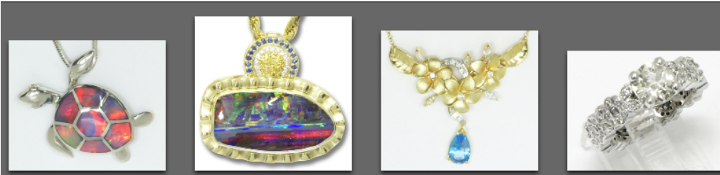
Second, third and people's and public choice winners.